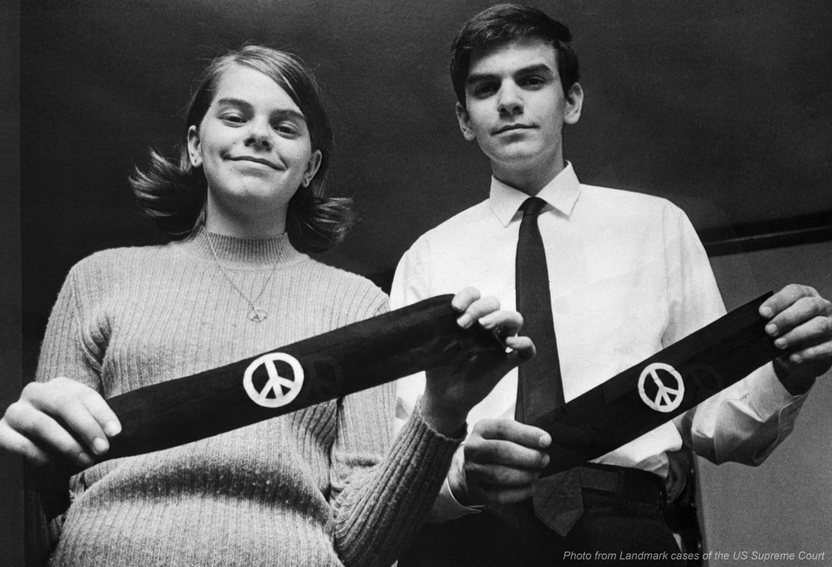
Photo from Landmark cases of the US Supreme Court