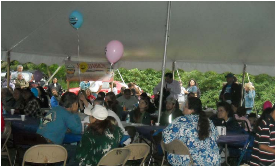
2009 Cultural Connections Picnic

Next year, with the help of our partnering sponsor, "Shared Visions", the picnic will achieve "festival" status. Stay tuned!