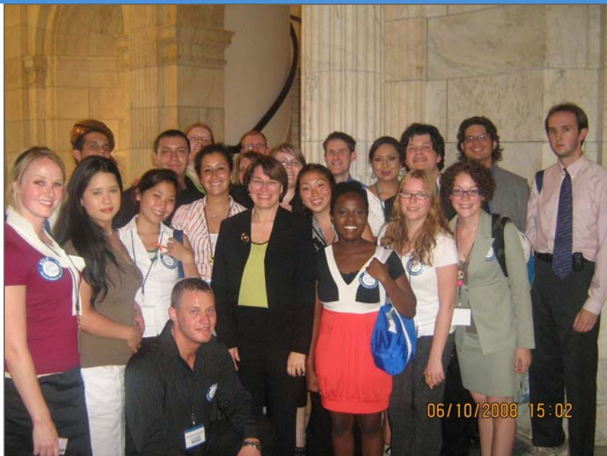
24 Young Minnesotans meet with Senator Klobuchar to discuss torture, and spying. Meetings were also held with Senator Coleman's office, and Representatives Bachman, Peterson, Ellison and McCollum.